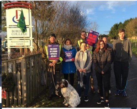
Borders (Newton St Boswells)