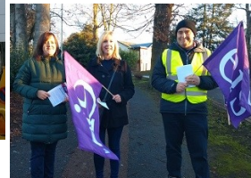
Dundee & Angus (Left—Gardyne, Right—Arbroath)