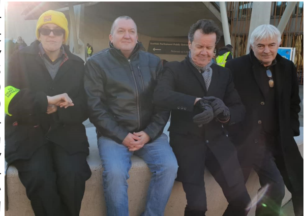
Waiting for management to #NegotiateNow

We offered AGAIN to meet management before the strike day. We offered to meet with them anywhere and at any time. Management REFUSED to meet us before the strike day, and responsibility for the strike lies firmly at their door.