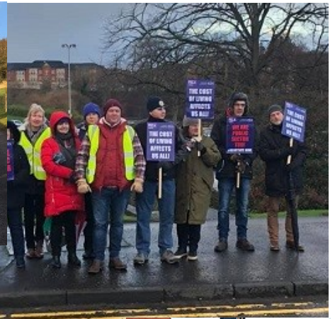
Ayrshire College (Ayr)